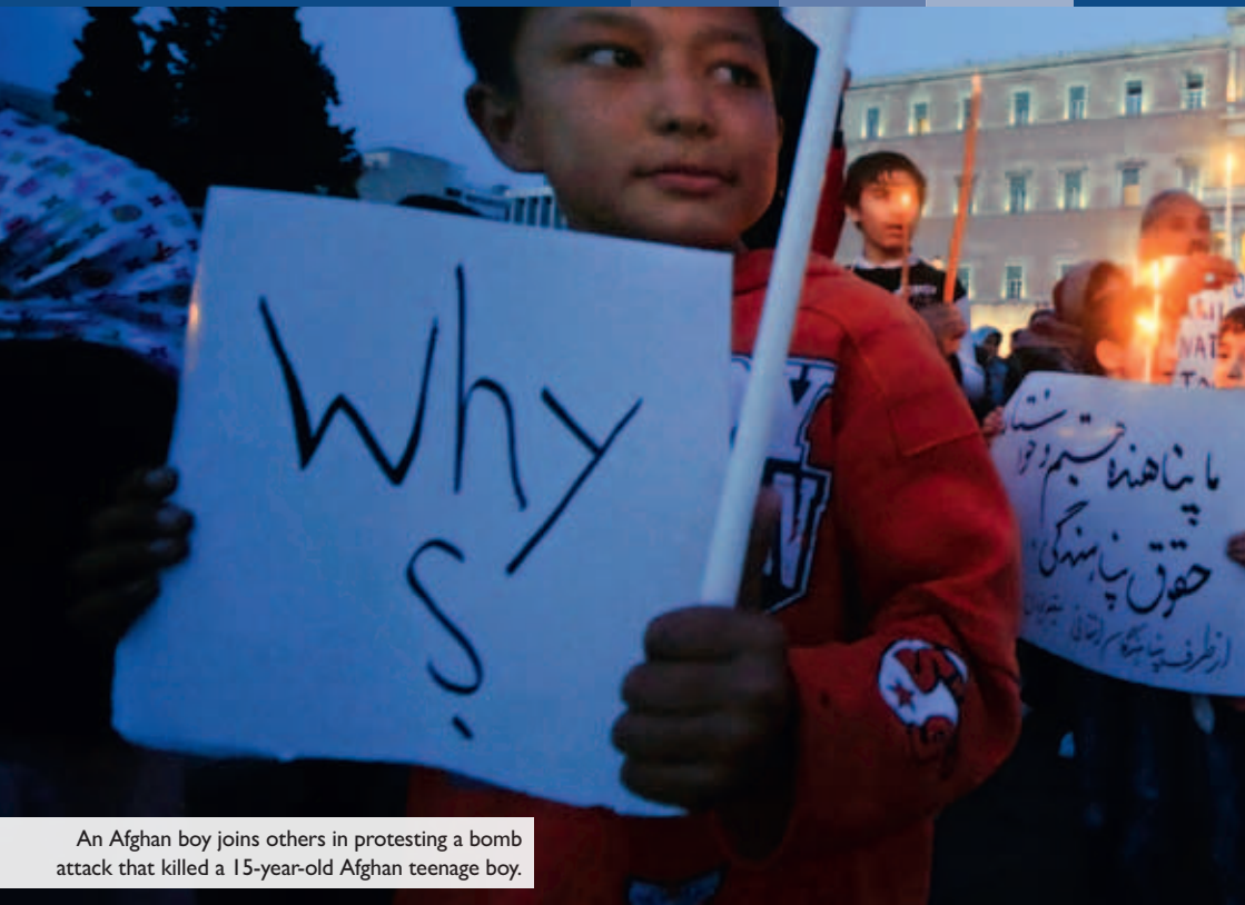
An Afghan boy joins others in protesting a bomb attack that killed a 15-year-old Afghan teenage boy.