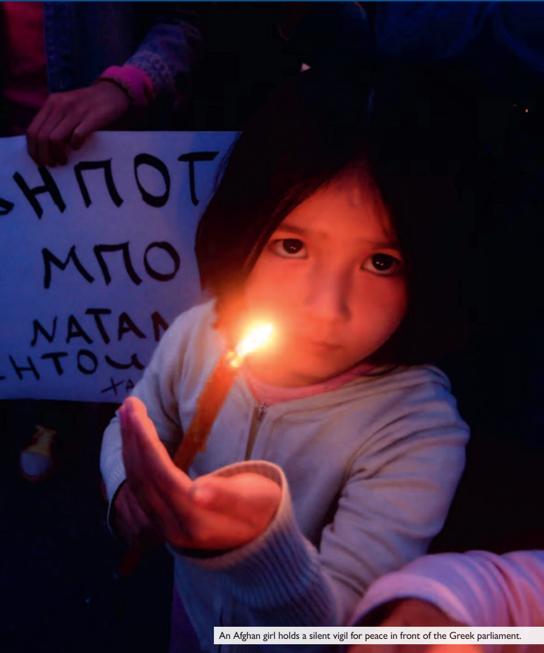
An Afghan girl holds a silent vigil for peace in front of the Greek parliament.